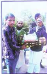
કાશ્મીરના પૂરપીકીતોને સહાય