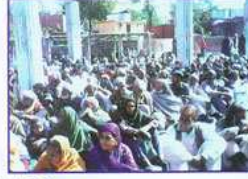
કાશ્મીરના પૂરપીકીતોને સહાય