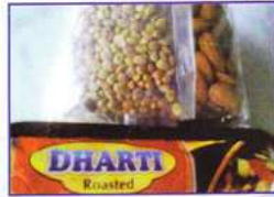
શીરખુરમા કીટ જુલાઈ-૨૦૧૪