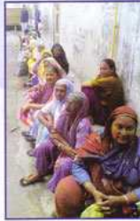
રમઝાન બેવા ફી ફૂડ કીટ જુલાઈ-૨૦૧૪