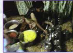
'ફી' ટીફીન સર્વિસ