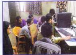
માઈનોરીટી સ્કોલરશીપ ઓનલાઈન ફોર્મ ભરવા અંગેનું માર્ગદર્શન સેવા ઓગષ્ટ-૨૦૧૪