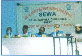
Spoken English Classes-2013