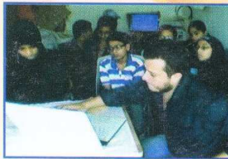
Government Minority Scholarship Guidance