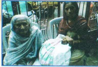
Ramzan Free Food Kit Distribution-2013