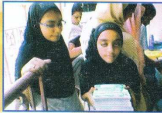
Free Note Book Distribution-2013