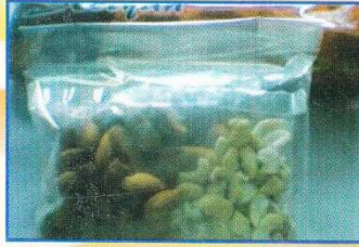
Shirkhurma Kit Distribution-2013